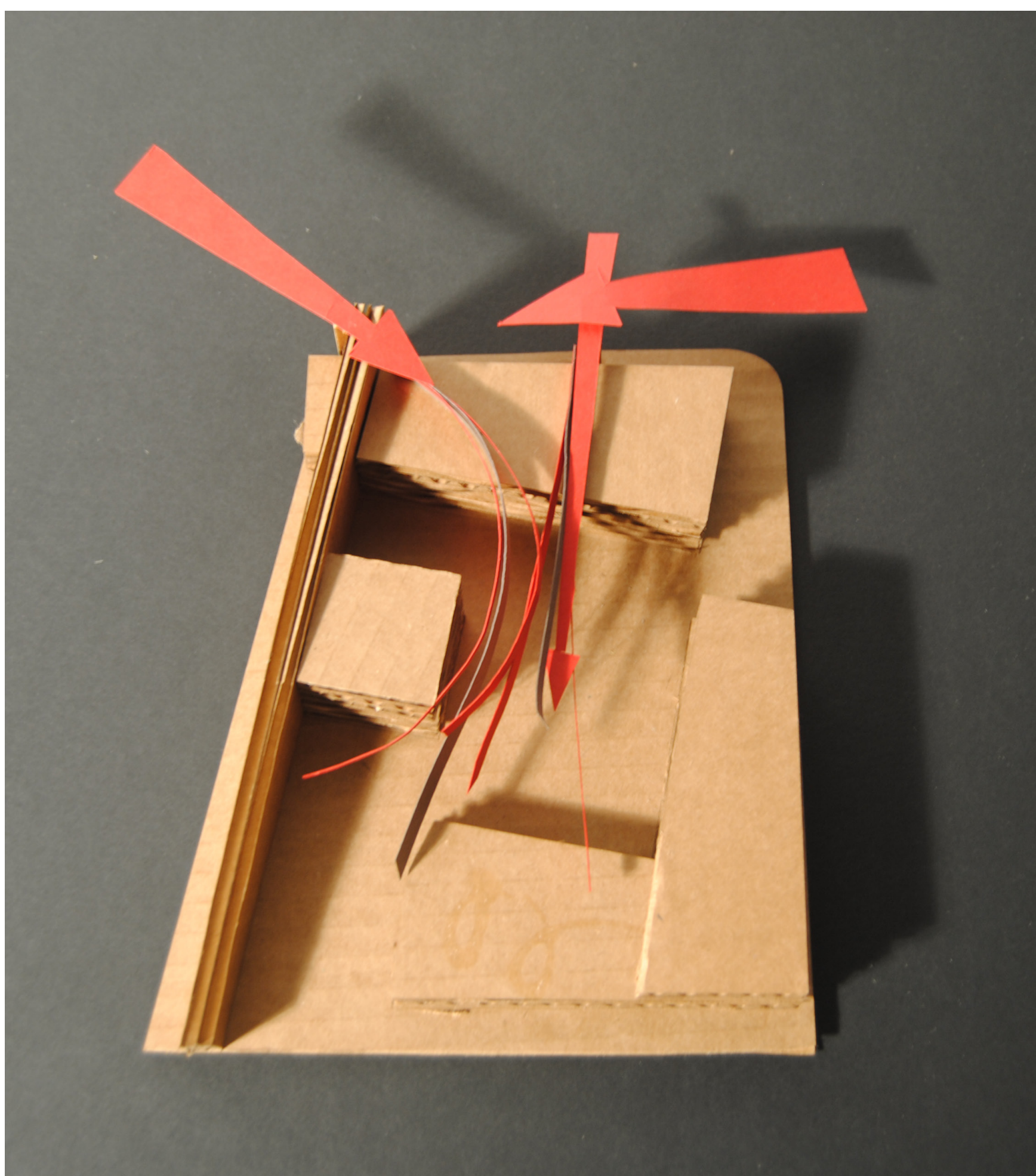
Access and Movement